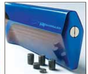
Fine tune-able weight system.