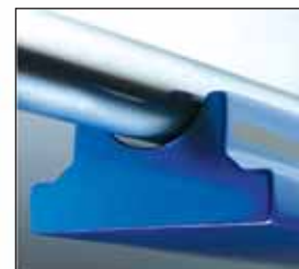
Unique vertical side walls.