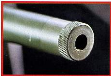
All McMillan barrels are premium, hand-lapped, match-grade stainless steel, capable of delivering exceptional performance.

We used a Leupold 12-40x60mm spotting scope with the same H25 reticle in