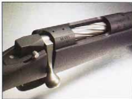
The fluted bolt on McMillan's new Tactical Hunter looks good and helps to reduce overall weight.

W hen you hear the name McMillan, a vision of a SWAT team member or sniper going about his business with a military-style rifle that shoots bug-hole groups comes to mind. I've seen a few of McMillan's famous tactical rifles at the range and was very impressed with their accuracy and reliability in the hands of a trained technician (shooter). This style of shooting requires making shots from different positions and unknown ranges at targets different from the normal bull's-eye targets we use; obviously precision bullet placement from a cold barrel is